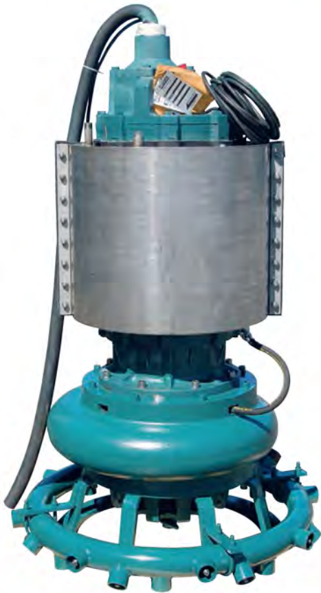
TBM200MH-PBO WITH OPTIONAL WATER JACKET AND JET RING